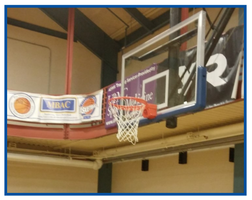
The new glass backboards can be found on the side baskets.

The side baskets now have glass backboards. This update has been on the players' and coaches' wish lists as glass backboards are preferred because they produce a better rebound surface for the ball. Check out this new addition when you come to a game.